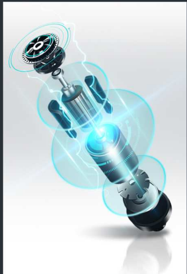
AC 2.0CHP, Peak 4.5HP AC 2.5CHP, Peak 5.0HP